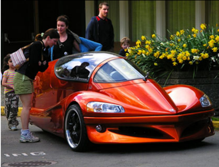
Future Vehicle Technologies eVaro